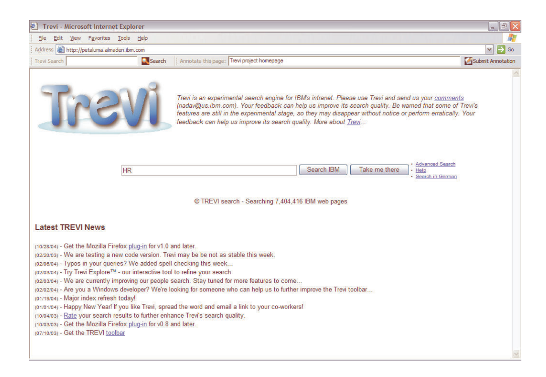
Figure 1: The Trevi Toolbar contains two fields: a search field to search IBM intranet using Trevi, and an annotation field to submit an annotation for the page currently open in the browser.

query as an annotation to every page the user clicks on may assign annotations to irrelevant pages. We experiment with several techniques for deciding which pages to attach an annotation to, making use of the users' click patterns and the ways they reformulate their queries.